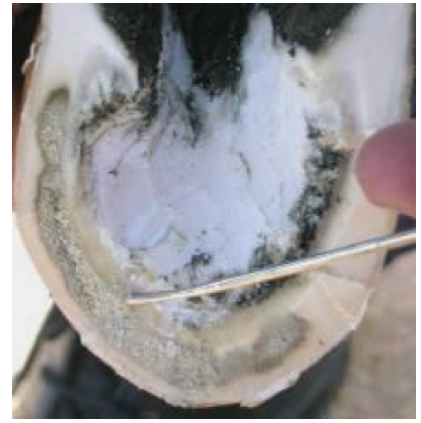
All necrotic and discoloured material should be removed to expose clean, healthy horn.

It is possible to resect high up the hoof wall (more so than in the horse), to remove all the affected material. Exposure is necessary to provide an aerobic environment which inhibits bacterial and fungal colonisation.